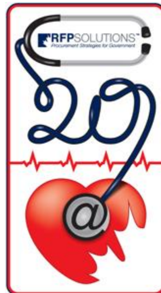
RFPSOLUTIONS' Young @ Heart H&S Donation Meter

20 Years Young @ Heart What's New? Procurement Tools & Tips